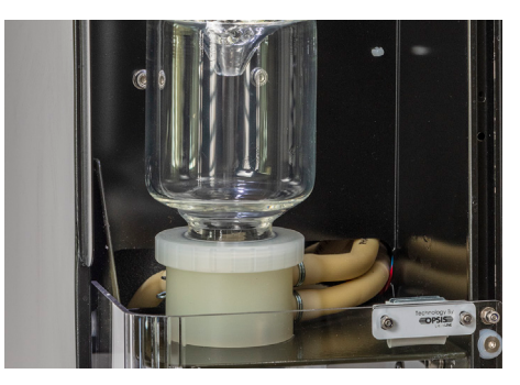
PROTECTION WITH BLACKLINE AS WELL AS PTFE COATING AROUND SENSITIVE PARTS. POLYPROPYLENE SPLASHHEAD OPTIONAL.