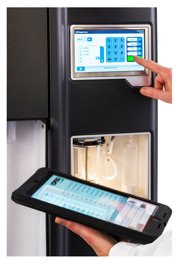
THE LABCONNECT SOFTWARE ALLOWS FOR EASY CONNECTIVITY TO YOUR LABORATORY